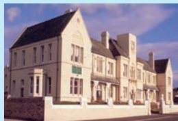
CIU SALT BURN HOUSE

A geography teacher, he has been Branch Secretary since 2009 and was elected to the National Executive in the same year. He had been a member of the Branch Executive for 15 years before that and is in his second spell as Secretary of the Westwood Club in Washington.