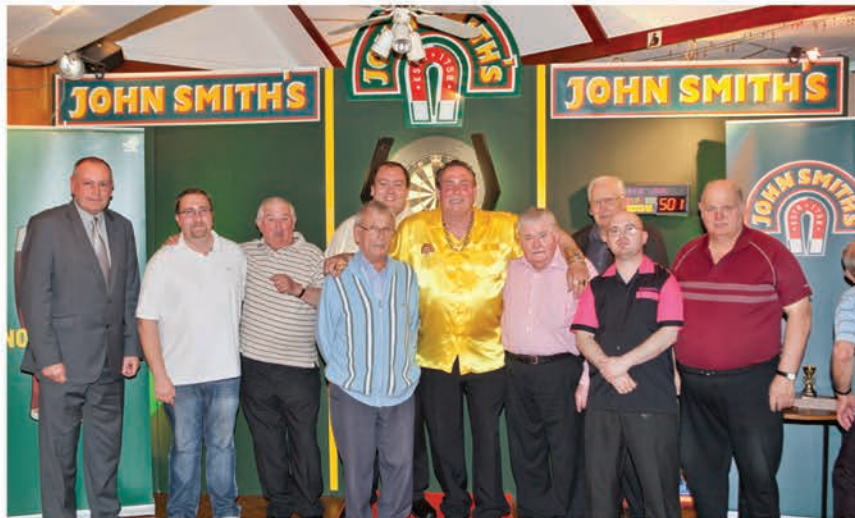
SUPPORT: (L-R): Members of Farnborough Social Club's Committee watched players from their darts teams take on Bobby George

Members of Farnborough Social Club's darts teams had the chance to 'toe the oche' with the legendary Bobby 'Dazzler' George at its Kent premises thanks to an evening organised by HEINEKEN in the UK's leading ale brand John Smith's. More than 80 turned out to watch or challenge one of the sport's most recognised former champions at what was a very successful business-building