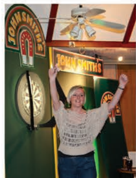
WINNER: One member of the Ladies team beat the 'Dazzler'